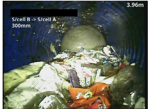
S_cell A-S_cell B_ef0019a9-a54f-4331-998c-f89f2b37d0f9_20200203_16564 5_120.jpg, 00:01:00, 3.96 m Settled deposits, hard or compacted, 40% cross-sectional area loss, rubbish