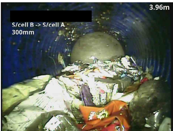
S_cell A-S_cell B_d7b508d3-8ada-4cb0-94d2-6b834e10eed0_20200203_165 713_153.jpg, 00:01:05, 3.96 m General remark, Capped end ahead