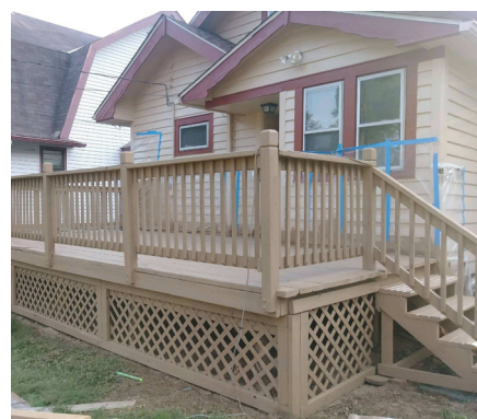
▲ The team updated a worn deck for a new tenant.