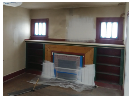
▲ Rough, damaged walls required a full day of skim coating.