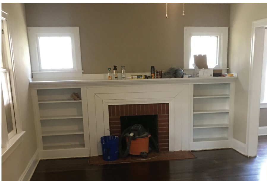
▲ The team sanded the stains on the hardwood floor, and then stained and sealed it against future damage.

Located on the west side of Cleveland in a neighborhood called Kamm's Corner is an unassuming 2,500-square-foot rental home built in 1929. The current owner had purchased the house in the early '90s but began renting it out in 1999. Snyder Bros. Painting had painted the exterior in 2016, so the company was invited back to renovate the interior in 2018 after tenants changed.