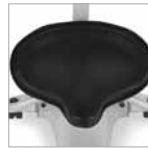
Saddle Seat (Optional)