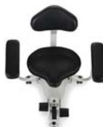
Saddle Seat (Optional)