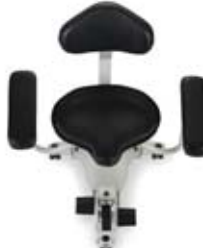
Saddle Seat (Optional)