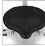
Saddle Seat (Optional)