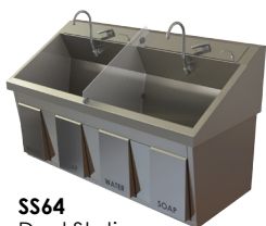
SS64 Dual Station