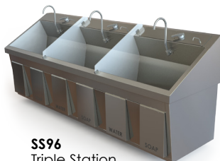
SS96 Triple Station