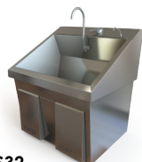
SS32 Single Station