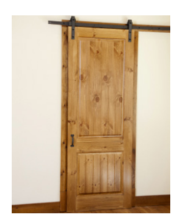
"Barn Door" style passage door between kitchen and studio.