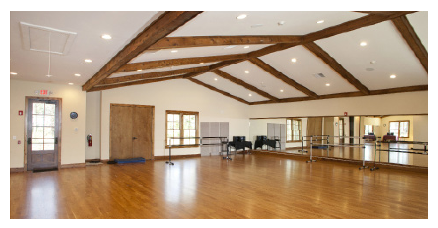
Dance Studio Floor is a resilient hardwood floor system with cork underlayment especially for dance studios, walls include mirrors and barre. Studio features stain-grade faux exposed wooden beams and peaked ceiling with hardwood paneling in studio.