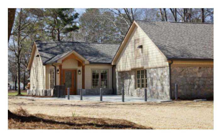
Livery Stable–Two of its four hand-hewn granite boulders walls were left in place and incorporated into the new building.