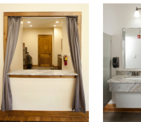
Quarry tile and base in rest rooms and kitchen.