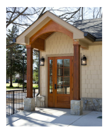
Front Door and all Windows are custom-built.