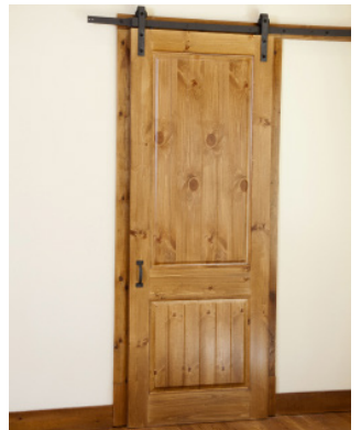
“Barn Door” style passage door between kitchen and studio.