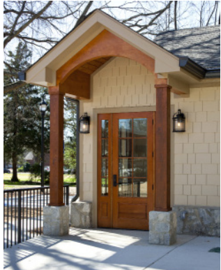
Front Door and all Windows are custom-built.