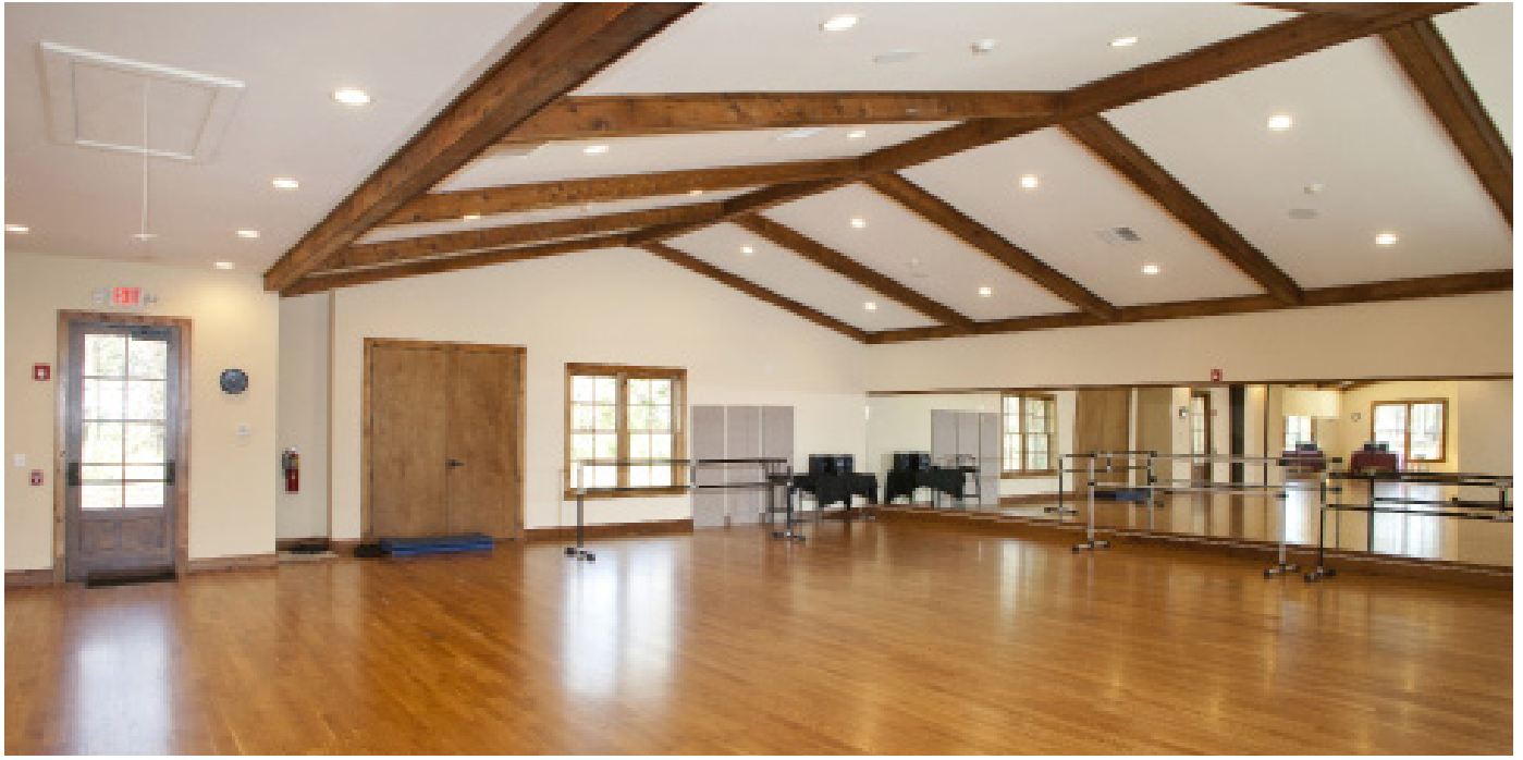
Dance Studio Floor is a resilient hardwood floor system with cork underlayment especially for dance studios, walls include mirrors and barre. Studio features stain-grade faux exposed wooden beams and peaked ceiling with hardwood paneling in studio.