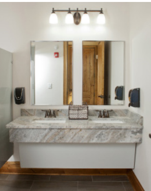
Quarry tile and base in rest rooms and kitchen.