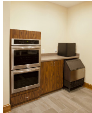
For events, the building is equipped with warming kitchen, custom surround sound system and a custom-built Movable Partition.