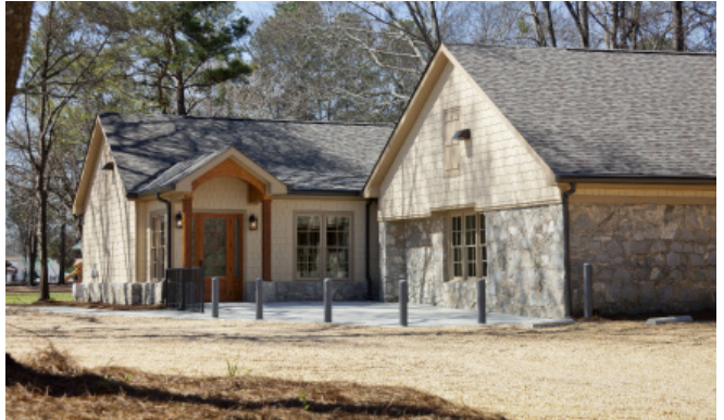
Livery Stable—Two of its four hand-hewn granite boulders walls were left in place and incorporated into the new building.