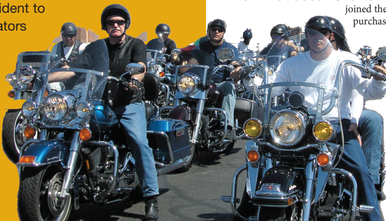
Inaugural Ride, August 2005, Las Vegas, Nevada

Additionally, 16 members (one from each of the districts represented by the IAFF) are appointed by the General President to serve as district event coordinators responsible for events and activities in their districts. Additionally, state/provincial coordinators have been appointed to assist the district event coordinators with support events and activities within their respective state or province.