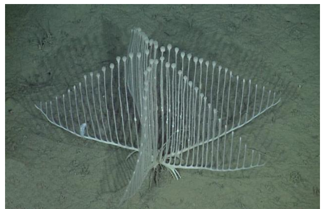
Chondrocladia lyra (harp sponge)