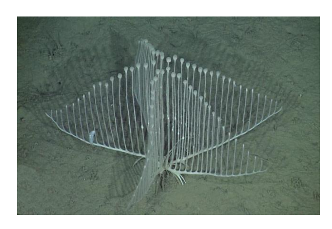
Chondrocladia lyra (harp sponge)