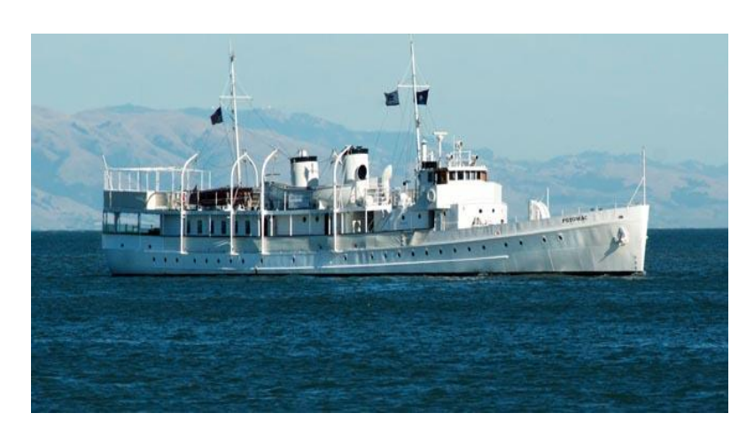
USS Potomac in SF Bay

Berthed at 540 Water St, near Oakland's Jack London Square, Potomac is available for dockside, docent-led tours on most Wednesdays, Fridays and Sundays. She cruises the Bay on special occasions like Mother's Day, Father's Day, Fourth of July and Fleet Week. Tickets are available online at TicketWeb.com. Call The Potomac Association at (510) 627-1215 for more information.