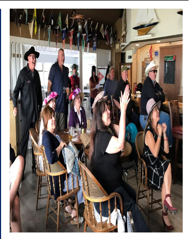
Cheering on their favorite horse at OPYC's annual Kentucky Derby party.