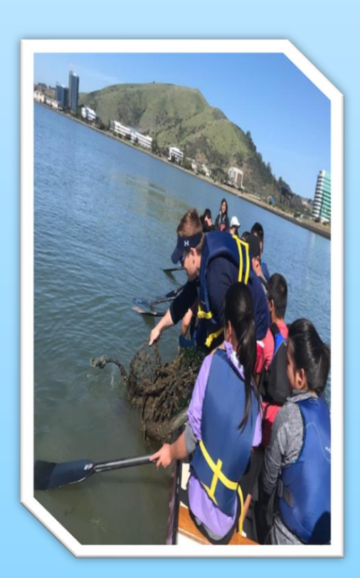
OP Dragon Boaters celebrate Earth Day by cleaning the marina. Yes...that's a bike they pulled from the water.