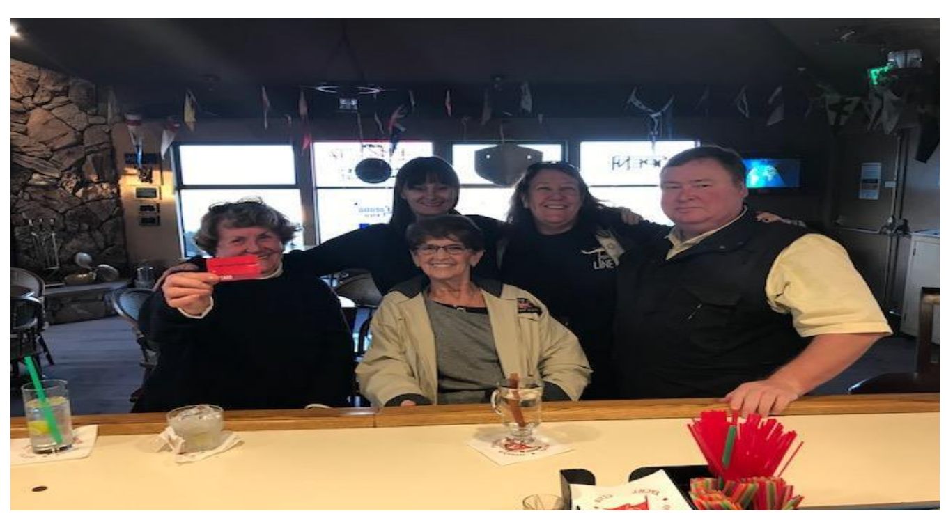
Happy OPYC members saying fond farewell to the bar card.