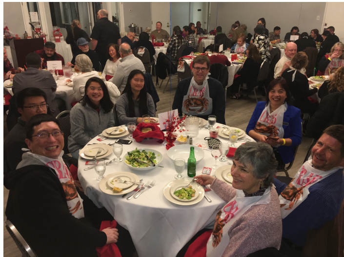
Support from Oyster Point Dragon Boaters