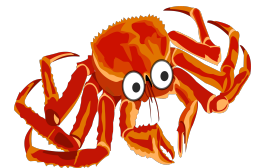
Below: Oyster Pointers enjoying dinner after all their hard work