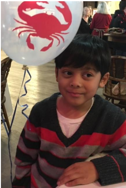
You know there is a Warriors Game on tonight, don't you!