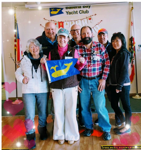
February cruise-out to Ballena Bay YC for a Valentines celebration