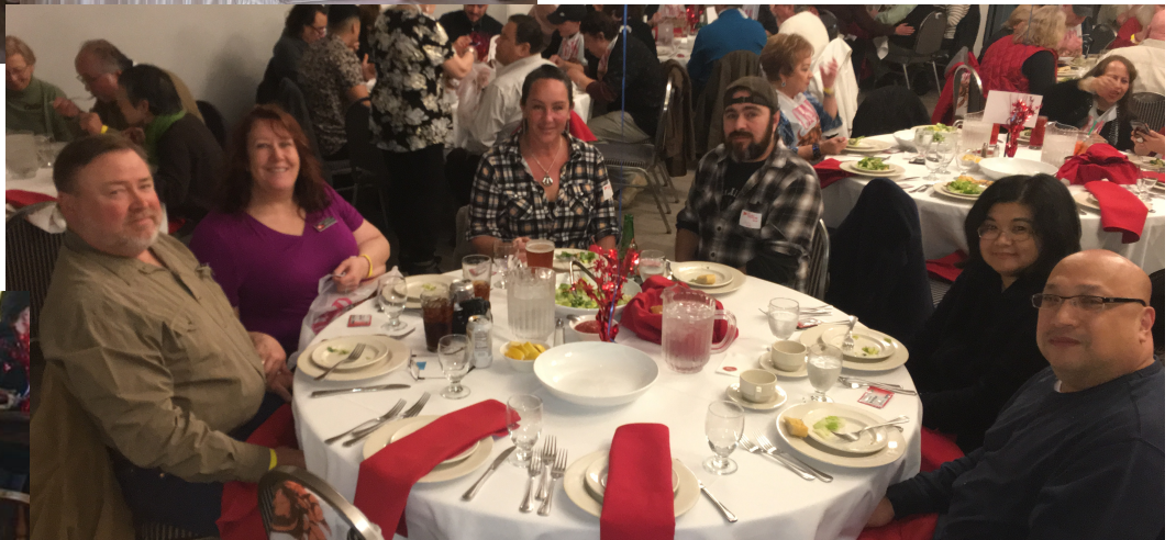
Hard working volunteers enjoying a meal and each other's company