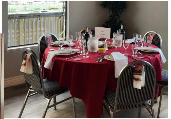
One of the VIP tables