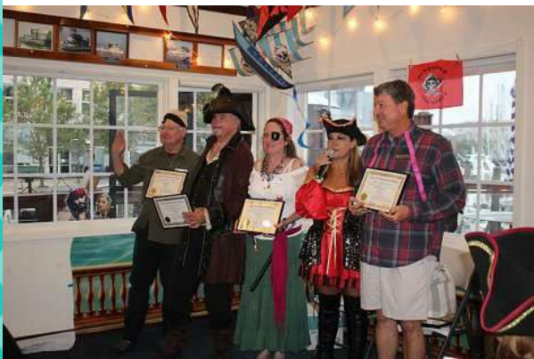
Petaluma YC Memorial Weekend