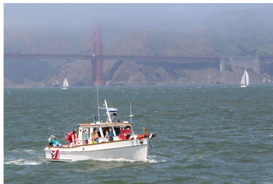
Tutu-2nd Place 2022 Opening Day