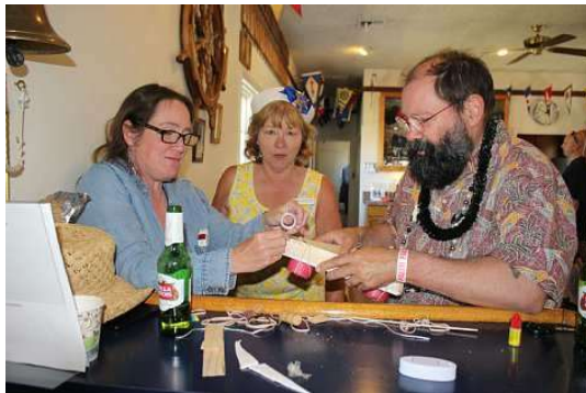
Petaluma YC Memorial Weekend