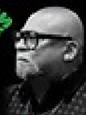
Dr. Maulana Karenga