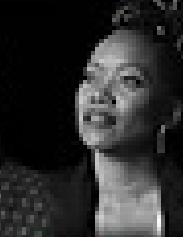
Actress Erika Alexander