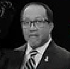
Rev. Benjamin Chavis