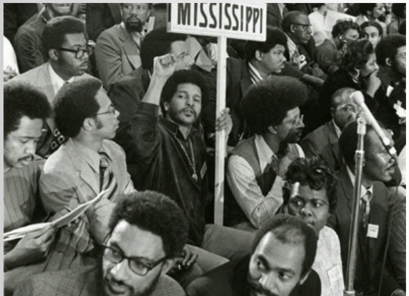
Image of the first National Black Political Convention, aka the Gary Convention, held in Gary, Indiana on March 10-12, 1972

SUPPORT THE National Black Radical Political Convention 2025! Your support and contributions will enable us to meet our goals. Your generous donation will fund our work. Donate here!