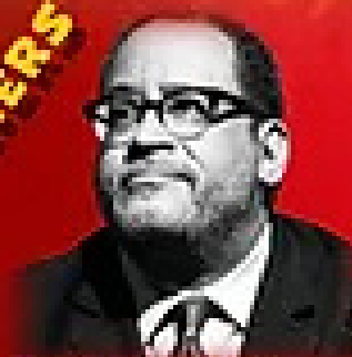
Dr. Michael Eric Dyson