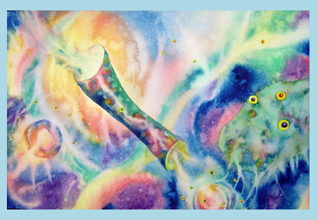
Transmutation, watercolor on paper, 13"x20", 2006

And yet, what joy I feel in the process! The object created for others to see is the best reason itself to ignore a few imperfections. Go on, take the plunge and start creating!