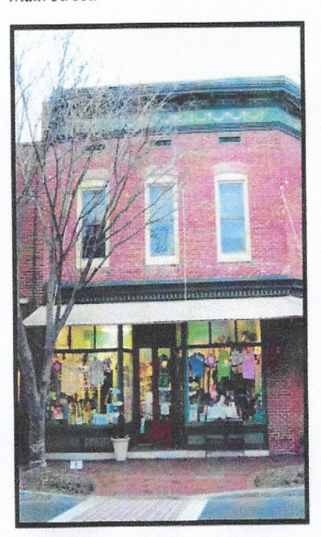
Profits from The Church Mouse help support St. Paul's Outreach Mission.

Saint Paul's Episcopal Church started an outreach to the community 50 years ago in a small shop attached to the Atlantic Hotel. It then relocated to a warehouse on Old Ocean Blvd. We moved 30 years ago to our present location 101 North Main Street.