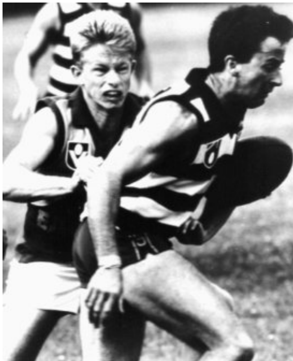
The faces say it all - footy action BARFL style!

The Demons' hard fought 8 point victory over North London in the preliminary final in no way suggested that they would be capable of turning the tables on the Wildcats a week later in the grand final at Hendon, and indeed for long periods of a tense, scrappy game they appeared distinctly second best. However, a football game is won on the scoreboard, and despite their apparent domination West London were never able to get more than a couple of goals in front. Then, as time-on in the last quarter approached, the Demons suddenly unleashed their best football of the day; two quick goals saw them grab the lead by a couple of points and, despite the Wildcats' best efforts, they managed to hang on until the final siren to record their second 2 point grand final win in three seasons, 12.5 (77) to 11.9 (75).