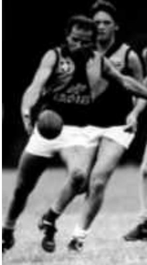
Action from the 1990 grand final curtain raiser between East Midland and the West Country Tigers

The brown and golds started hot favourites on two counts: the match was being played on the Hawks' own home ground in Wimbledon, and both previous encounters between the sides had seen them emerge victorious, by 40 points in round 5, and 5 15 points in a hard fought 2nd semi final a fortnight earlier.