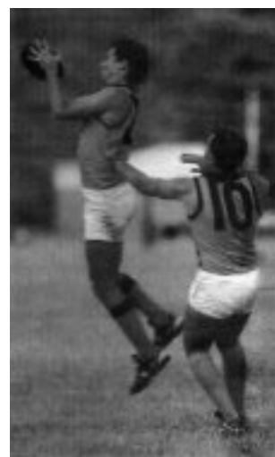
The Wandsworth Demons in action.

Thames Valley Football Club was unfortunately forced to disband prior to the start of the 1993 season owing to a lack of players and a demoralised club administration. During three seasons in BARFL the Magpies won just 5 of their 44 matches, the highlight being a 30 point win over London Hawks in 1991, but with a predominantly British playing contingent they were never going to be in a position consistently to challenge the stronger London-based clubs, particularly after the dilution of the 50-50 Rule.