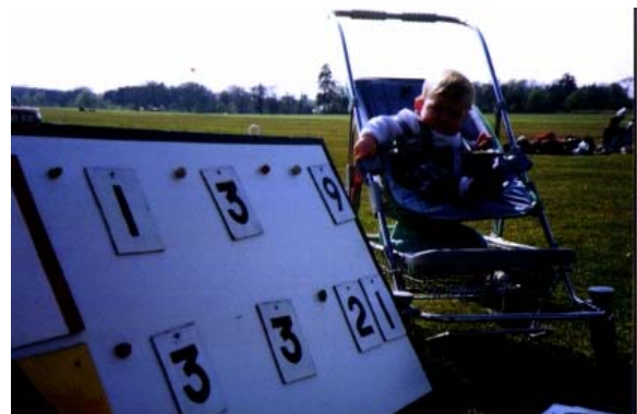
They start 'em young in BARFL! The picture above shows probably the world's youngest ever scoreboard attendant keeping a close eye on play (in between feeds) during the round 2 1991 clash between Sussex and East Midland at Aldershot.

Meanwhile Thames Valley re-located from Wokingham to Aldershot, and Wandsworth adopted the navy and red playing uniforms of namesake the Melbourne Demons following the long-awaited arrival of their AFL-donated playing kit from Australia. With businessman Paul Roberts at the helm BARFL was now at its peak, both in terms of imaginative, aggressive promotional activity, and standard of on field play.