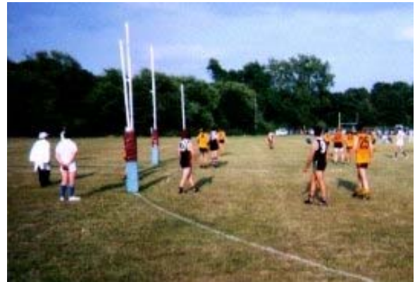
A scene from the 1993 BARFL grand final - and no, your eyes aren't deceiving you: the goal and behind posts really do follow the curve of the oval. The question is, does this flagrant transgression of the laws of the game render the Hawks' eventual premiership victory invalid?

organisational point of view there was much room for improvement, while on the field the team lost both matches played.