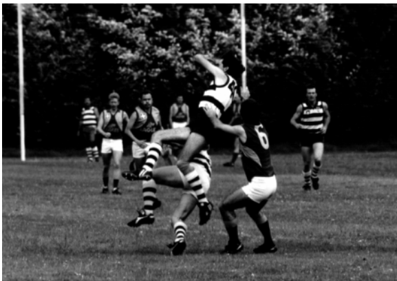
A West London player attempts to mark against East Midland at Leicester.

On the representative front a full international was held at Popes Field in July between Great Britain and Denmark. The Great Britain side, whose players had trained together quite intensively for several weeks leading up to the game, performed admirably to win with some ease, 19.16 (130) to 6.4 (40). The curtain raiser to the international saw a clash between the 'BARFL Victorians' and 'BARFL South Australia/Western Australia', with the latter recording a 28 point win.