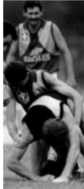
Holding the ball or holding the man?

Hopes that the new, slim line, eight team BARFL competition would recapture some of the zest and excitement of the League's early years did not last long as 1996 proved to be, if anything, the most lop-sided season to date. As a result it became increasingly difficult for the three British-orientated clubs - East Midland, Lea Valley and Sussex - to maintain the enthusiasm of their players.