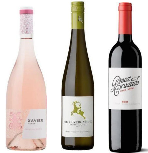
Old world set

Xavier Vignon Cote du Rhone Rose 2020 Hirsch Hirschvergnügen Grüner Veltliner 2020 Gomez Cruzado Crianza 2017