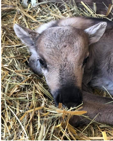
Kenai Reindeer Farm

Video links by many fellow reindeer owners of cows at calving time WARNING- some graphic content that may not be appropriate for very young viewers of animal birthing process, a natural part of farm life,