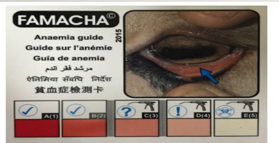
Figure 2. Photo of FAMACHA® scoring chart. Colors are likely not accurate in this publication. Cards are provided to individuals that complete an accredited training workshop. Online training can be found at: http://web.uri.edu/sheepgoat/famacha/