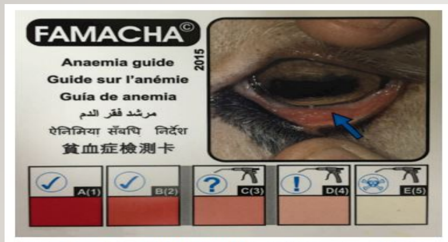
Figure 2. Photo of FAMACHA® scoring chart. Colors are likely not accurate in this publication. Cards are provided to individuals that complete an accredited training workshop. Online training can be found at: http://web.uri.edu/sheepngoat/famacha/