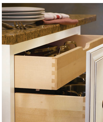
Drawer Box upgrades