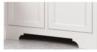
Shaped Bottom Rail (Shaped side also available)