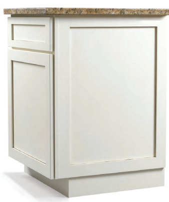
False Door Side