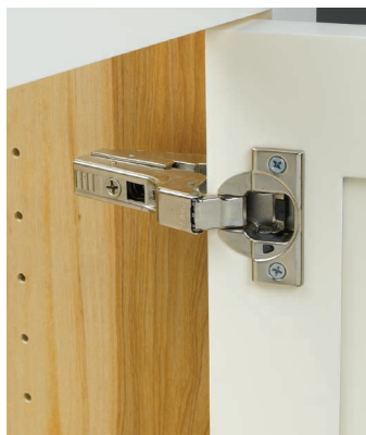
Blum Inset Hinge