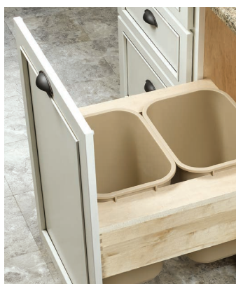
Trash Can Pull-Out