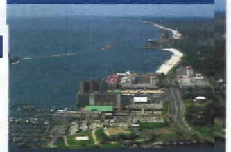
Aerial View of the Gulf Coast