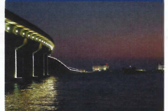
Enjoy the Picturesque Views

Departure: United Methodist Church of Sun City Center, FL @ 8AM