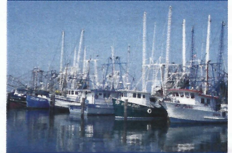
The Beautiful Gulf Coast Awaits