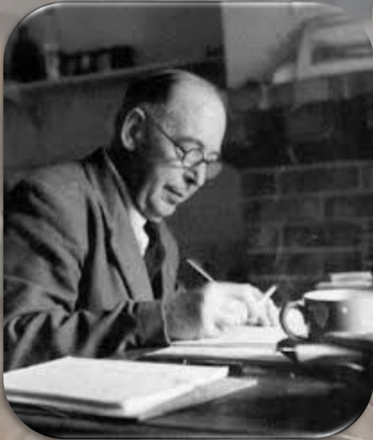
C. S. Lewis The Complete C.S. Lewis Signature Classics, 411.

For God is not merely mending, not simply restoring a status quo. Redeemed humanity is to be something more glorious than unfallen humanity would have been, more glorious than any unfallen race now is. . . . And this super-added glory will, with true vicariousness, exalt all creatures and those who have never fallen will thus bless Adam's fall.