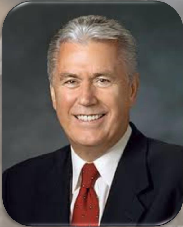
Dieter F. Uchtdorf “The Gift of Grace,” General Conference, April 2015

So, how do we “get it” and obtain Grace? 2 Nephi 25:23