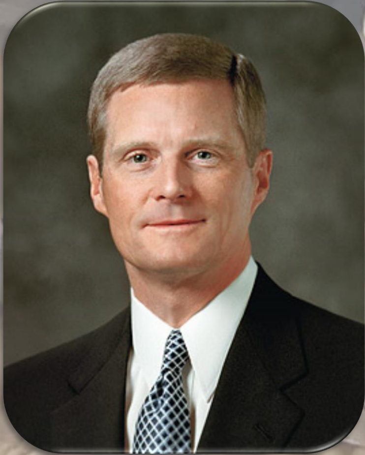
David A. Bednar

“In the Strength of the Lord”, BYU- Idaho Devotional, January 8, 2002