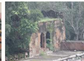
PARKOTA (OLD WALLED CITY)

THE MOOTI DOONGRI FORT AND PALACE IS VISIBLE ON THE SOUTH SIDE OF THE B&B WITH THE GRAND ISHWARI LAT ON THE NORTH-EAST SIDE.