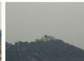
GADH GANESH TEMPLE

AJMERI GATE IS LOCATED AT A DISTANCE OF 400M WHICH'S JUST A TWO MINUTES WALK FROM OUR B&B, THE PARKOTA (OLD WALLED CITY OF JAIPUR) WHICH RECENTLY MADE TO THE UNESCO'S WORLD HERITAGE SITE IS LOCATED JUST ACROSS THE STREET FROM THE PREMISES DUE TO WHICH CABS, TUK-TUKS (E-RIKSHAWS) & AUTOS ARE EASILY ACCESSIBLE.