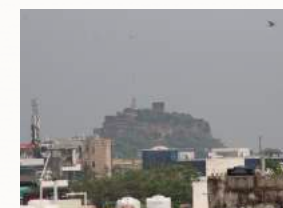
MOOTI DOONGRI PALACE & TEMPLE

THE MOOTI DOONGRI FORT AND PALACE IS VISIBLE ON THE SOUTH SIDE OF THE B&B WITH THE GRAND ISHWARI LAT ON THE NORTH-EAST SIDE.