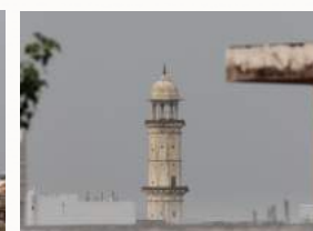
ISHWARI LAT OR THE VICTORY TOWER