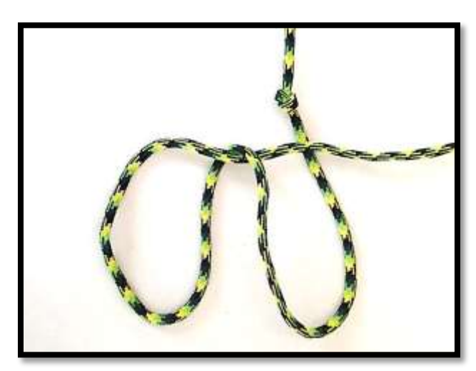
Step 3: Weaving

Take the other nine foot side of the knot and fold it as shown above making even rabbit ears about 3 inches long.