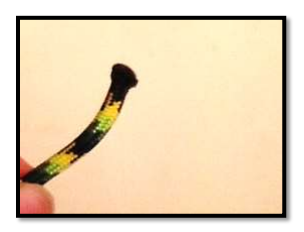
Step 5: Finishing Up

Trim any extra cord off the ends, and go ahead and melt the ends with a lighter.