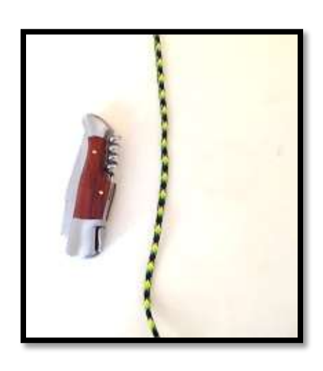
12 feet of para-cord Knife or scissors Lighter