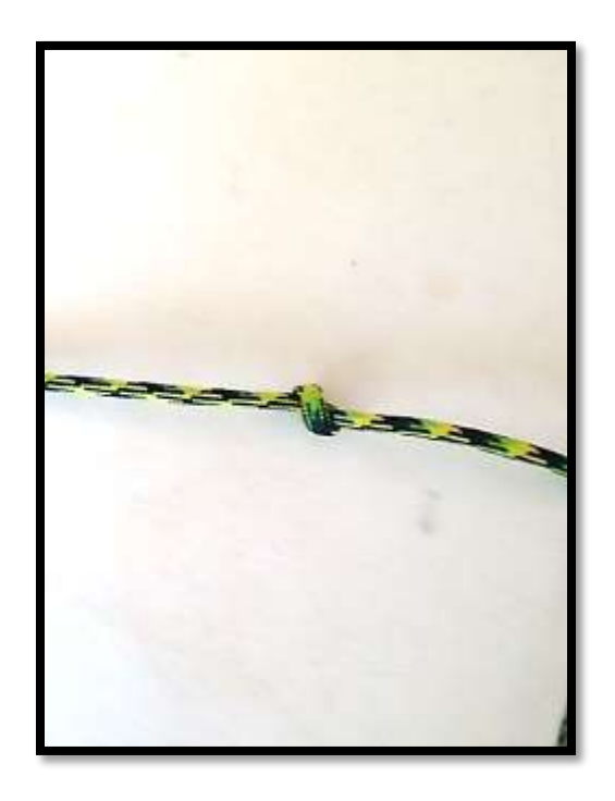
Step 2: Starting the Sling

Take one loose end and measure out about three feet. Tie a knot there to mark it.