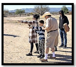
S.A.L.T. awarded over 100 Mammoth Hunting Licenses at the event!