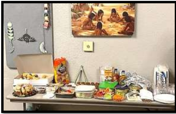
Always a great Potluck Brunch!