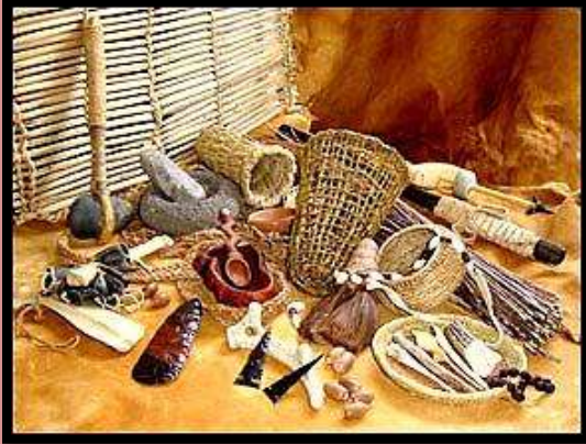
STONE AGE TECHNOLOGY FROM PRIMITIVE WAYS