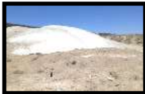
Salt and gypsum layers