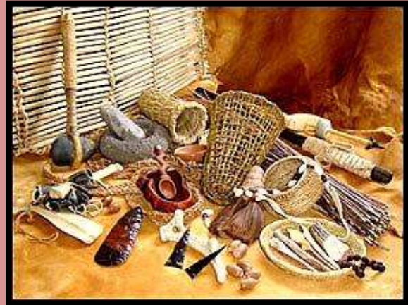
STONE AGE TECHNOLOGY FROM PRIMITIVE WAYS