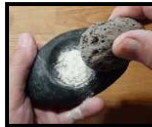
. Finished table salt

It was time to create my own interpretation of an ancient salt mill. A trip to my backyard rock cache yielded a small lava stone and a piece of softer mud stone. Several hours aggressively working the knuckle size piece of lava stone, along with some sand grit, against the fist size mud stone, produced a nice representation of an ancient hand held grinder. Now it was time to see if I could grind up some useable table salt