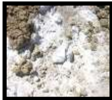
Close up of the deposit

The halite or salt was originally concentrated and deposited in the bottom of a large lake that at one time filled the area of the modern day Verde River valley. When the lake drained, layers of halite (salt) and selenite (gypsum) were left behind on the lake bottom. The Verde River eroded down through the deposits leaving them exposed today, along the west side of the valley.