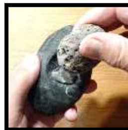
Salt grinder in action

Returning back to Phoenix with the rock salt samples, I wanted to continue to replicate the ancient technology. A lava stone mortar and pestle was just the right tool to break the chunks of salt crystals into smaller pieces that were about 1/8 inch in size. This was still pretty coarse so another step was needed to get to something that would be usable as table salt. I had seen some museum artifacts over the years that had the functional appearance of small hand held grinders, kind of a miniature mortar and pestal.