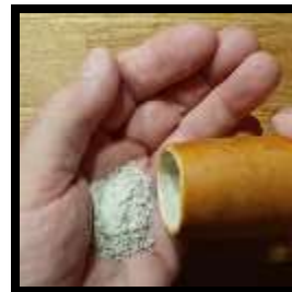
. Filling gourd salt cellar

A little twisting/grinding action with the small, and now rounded, lava stone, against pieces of salt crystal in the formed depression in the mud stone, resulted in a product that both looked like and tasted like modern table salt.