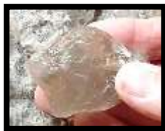
Chunk of salt crystals

We took trip to the site in the spring of this year. Much of the location has timber remnants left over from the commercial mines in 1900's. The brilliant white layers of salt and gypsum clearly identify the ancient deposits. Using a replica stone blade pick, chunks of halite (salt) crystals were easily chopped free from the exposed layers.