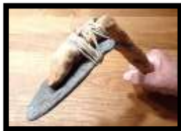
My replica stone pick

A certain amount of salt needs to be consumed to sustain life, so it is a critical resource for both ancient and modern peoples. Evidence at the site indicates that the Sinagua culture mined and traded, salt from this location, for close to 2,000 years. The existence of the ancient mines is also mentioned by Spanish explorers in 1583. More recently, some of the deposits were mined commercially in the early 1900's.