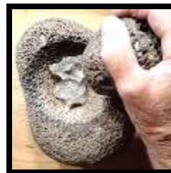
Lava mortar & pestle crusher

The mineral at this site is only 92% pure so the normally clear crystals are somewhat discolored due to other minerals. The lack of purity and the associated additional processing cost was one of the reasons the commercial mines closed in 1938.