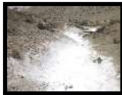
Ledge of rock salt

Southwest of present day Camp Verde, Arizona is the site of the ancient Verde River halite deposits. The mineral halite is more commonly known as sodium chloride or rock salt which can be crushed into table salt. Ancient artifacts found at the site indicate that these salt deposits have been mined for thousands of years.