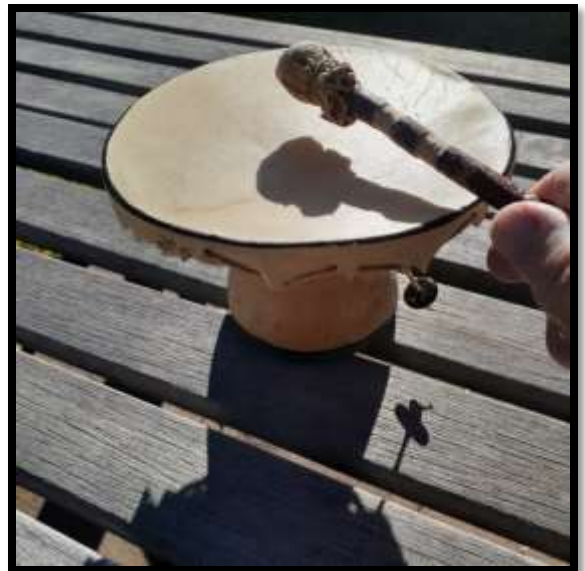
Finished drum ready for playing with beater made of tamarisk wood and rawhide