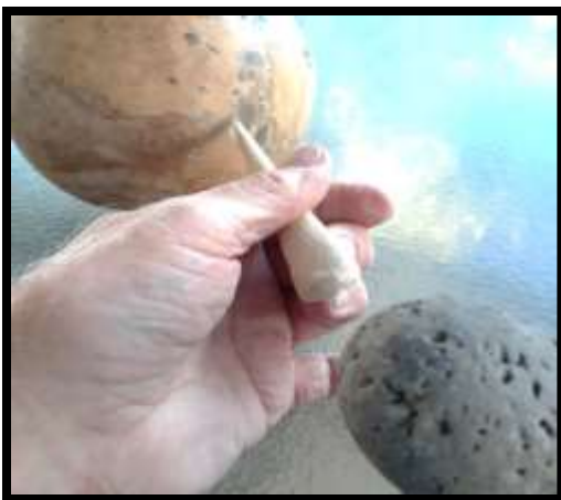
Bone awl used to make a series of closely spaced piercings along the cut lines.