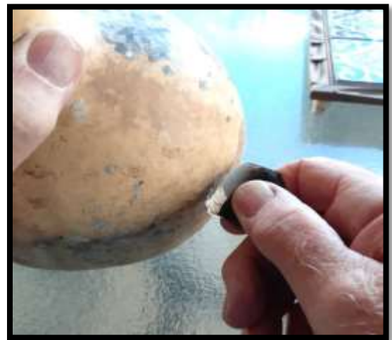
Obsidian blades used to score and cut between awl piercings.