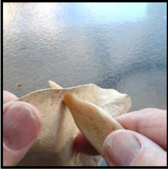
Goat skin rawhide for drum head cut to size and lacing holes added before soaking in water to soften and allow stretching over gourd opening.