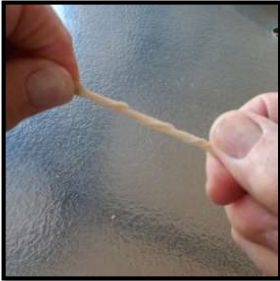
Deer rawhide cut into narrow strip before soaking in water and twisted into lacing.