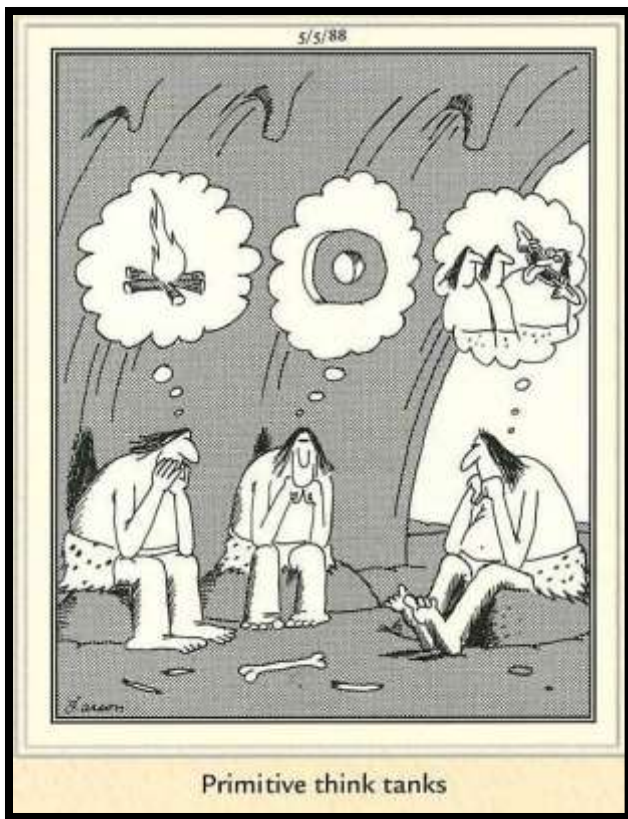
Primitive think tanks