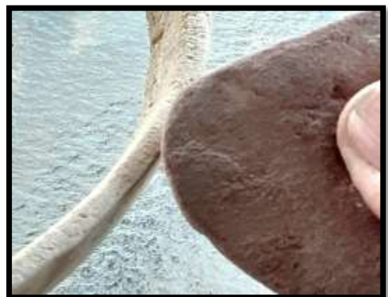
The rough cut edges smoothed with sandstone abrasive.