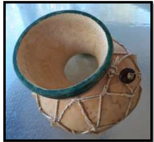
Lacing and drum head allowed to dry and shrink before decorating with paint and adding bone bead for clicker