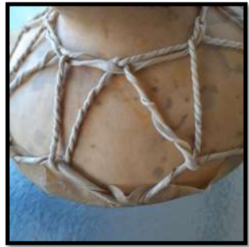
Wet rawhide lacing attaching wet drum head to gourd body