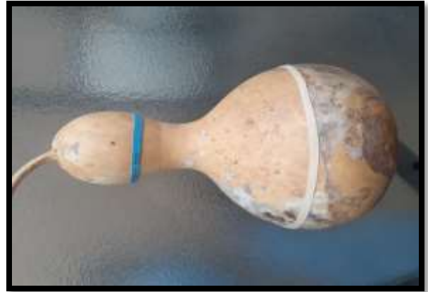
Dried dolbe gourd marked before removing top and bottom sections.

This project is about constructing a ceremonial hand drum using a gourd for the instrument body. The finished size is about 6 inches tall and about 7 inches diameter. The drum is meant to be played held in one hand or using an arm to hold against the hip while the other hand holds the beater.