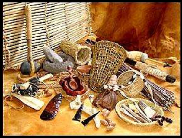
STONE AGE TECHNOLOGY FROM PRIMITIVE WAYS