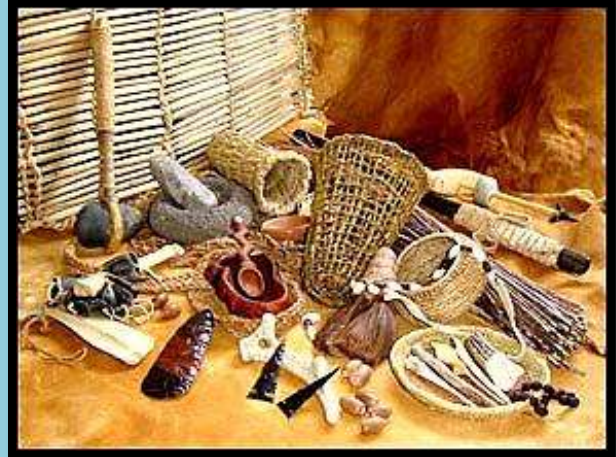
STONE AGE TECHNOLOGY FROM PRIMITIVE WAYS