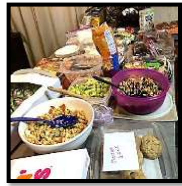
Delicious Potluck Brunch!