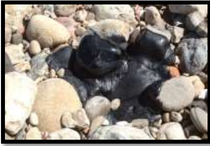
Photo 2: Interesting fact: Oil sludge that has washed upon the beach naturally. A park ranger said it seeps up off the ocean floor and not necessarily from an oil rig or ship.