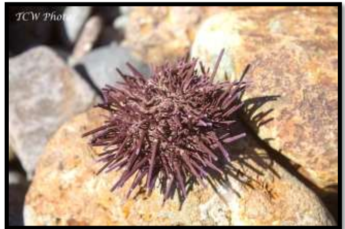
Photo 10: A Sea Urchin that had washed up on the beach and met its fate. A storm must had blown it up on the beach and it could not get back into the water.