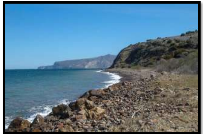
Photo 1: Is the rocky shoreline of Prisoners Harbor, there is very little sand on the beach.

After hiking back to Prisoners Harbor, I had several hours to hang out on the beach, relax and take pictures before the boat came to pick me up.