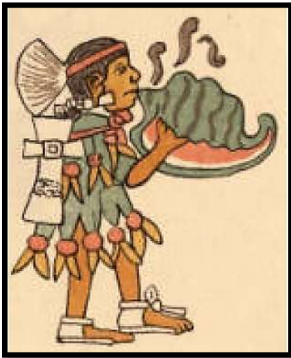
(Pictured here is a mid-16 th Century Aztec shell trumpeter known as a quiquizoani )

Seashell horns or shell trumpets have been used since at least the Paleolithic period and have been found around the world. They have historically been, and remain, an important part of a number of cultures. In North America and Mesoamerica these natural horns continue to be used as parts of ancient ceremonies, traditions, celebrations, and to make music. Constructed from mollusk or sea snail shells that are conical in shape, shell horns are easy to craft or modify for use as an instrument. Conch shells are a favorite for this purpose. Pronounced “konk,” these types of horns or trumpets are produced from a variety of species though queen conch shells are quite common. Conch cavities function based on the law of the Archimedean spiral or similar to the French horn. Those found in the Southwest are believed to have been carried here along trade routes.