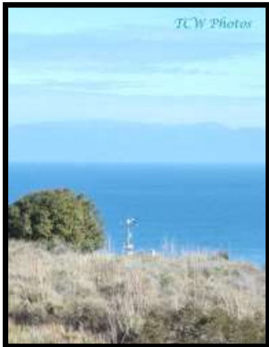
Photo 6: A weather recording station along the trail.