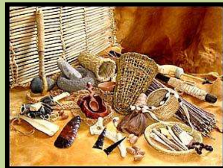
STONE AGE TECHNOLOGY FROM PRIMITIVE WAYS