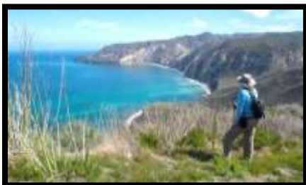
Photo 4: It wasn't long before I came to the trail jct. to Chinese Harbor and an overlook of Chinese Harbor.