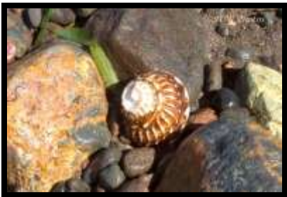
Photos 3-5: Seashells found on the beach. You cannot take anything from Channel Islands N.P. including seashells.