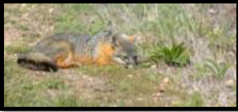
Photo 3: on the way back I saw two more Island Fox. This one decided to take a nap in the trail right in front of me. Wasn't even concerned about me.