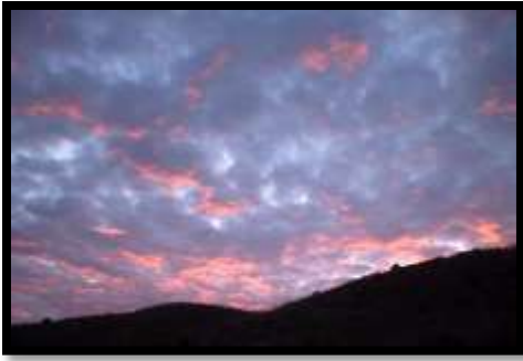
Photo 2: Day three began with a beautiful morning sunrise as I ate breakfast before heading back to Prisoners Harbor to be picked back up by boat.