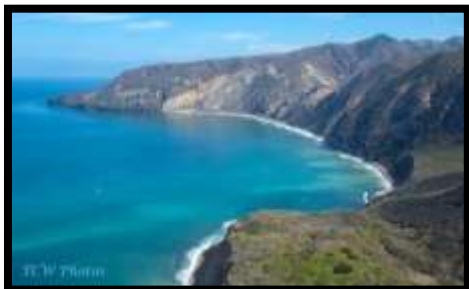
Photo 5: View of Chinese Harbor down below me. In the photo you can see some boats anchored in the ocean to give you some perspective of size. YEP! You go all the way Down there to get to the beach and all the way buck UP on the return. 🌈 But it was worth it.