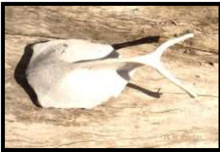
Photo 6: Can anybody tell me what marine animal this came from? It is bone and very odd and fairly large.