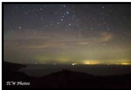
Photo 1: This is not a good photo that is in focus but a view from Del Norte Backcountry camp but still worth showing. You are looking at the ocean and mainland in the distance with city lights and stars in the foggy night. It is what I saw at night.

Day 3 of my backpacking trip in Channel Islands N.P.. Read the text and open up to see all the photos. I usually do not post this many photos at one time, but they all tell about my backpacking trip to channel Islands N.P.