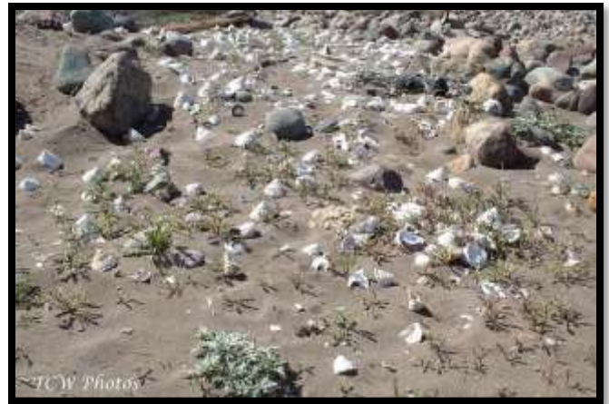
Photos 8 & 9: Seashells and Sea Urchins that had washed up on the beach.