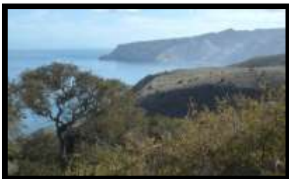
Photo 1: I walked back out to the Del Norte Trail and I was greeted with majestic views of Santa Cruz Island and the ocean along the way.

Day 2 of my 3 three day backpacking trip in Channel Islands turned into a most beautiful day hike to Chinese Harbor that is a wilderness rocky beach. It was an 8 mile round trip hike that is rated strenuous from Del Norte Backcountry Camp.