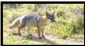
Photos 2 & 3: It wasn't long before I came across my first sighting of an Island Fox. We actually crossed paths on the trail not more than two feet apart. I took these Photos with a normal camera lens when it walked right passed. Island Fox is only found in the Channel Islands and nowhere else in the world.