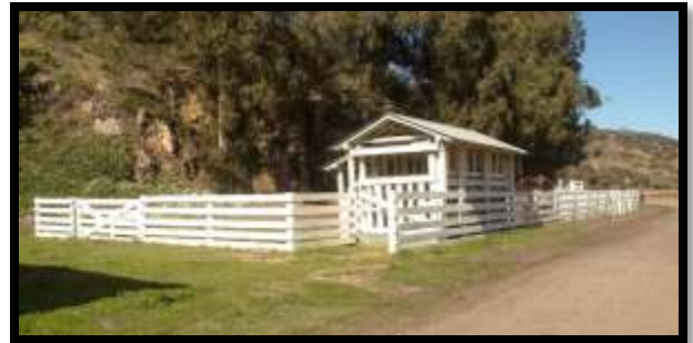
Photos 7-10: At Prisoners Harbor is an old sheep ranching building that was built in 1887 and corrals. There is no Sheep herding in Channel Islands N.P. but the building remains as a historical landmark.

After hiking back to Prisoners Harbor, I had several hours to hang out on the beach, relax and take pictures before the boat came to pick me up.