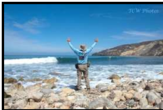
Photo 8: It is here I gave praise and thanksgiving to God for such a beautiful day in His Creation. I ate my lunch and explored the beach for a little bit and then it was time to go back UP to Del Norte Backcountry Camp.

Day 3 of my backpacking trip in Channel Islands N.P.. Read the text and open up to see all the photos. I usually do not post this many photos at one time, but they all tell about my backpacking trip to channel Islands N.P.