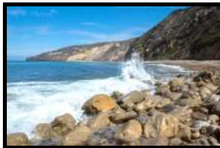
Photos 6 & 7: Once I got down to the beach, I had the rocky shoreline to myself.