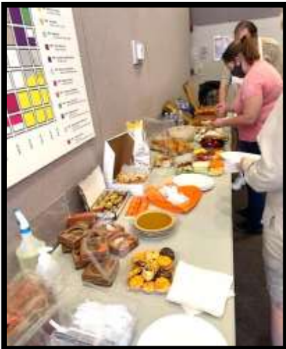
Delicious Potluck Brunch!