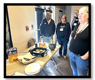
Making the fried Corn Pone