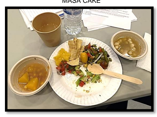
It was delicious! We would be a lot healthier if we ate like this!

AZTEC TURKEY POZOLE TRHEE SISTERS SOUP NOPALITOES SALAD SUCCOTASH CORN PONE PARCHED MAZE POPPED AMARANTH SEED ANCESTRAL JUICES ANCESTRAL CONDIMENTS MASA CAKE