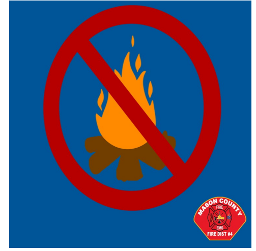
COMPLETE BURN BAN CONTINUES Propane units only

The other conversation is about "gate breaks". When entering into the community, we encourage you to go slow through the gate and even pause your vehicle for a moment once you have passed beyond the gate to deter someone behind you trying to "piggy-back" in. The road has sensors and once you pass beyond the gate the weight of your vehicle will send a signal to bring the gate down.