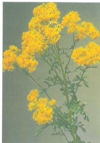
Tell-tale signs: leafy, flowering stalks, generally 2-4 feet tall.