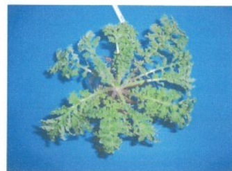
Young tansy ragwort plants have basal rosette of ruffled leaves.