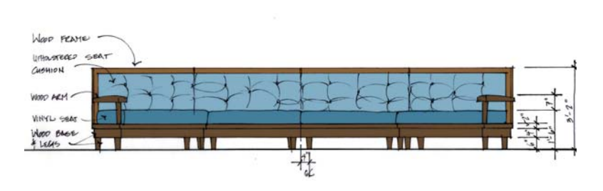
PLAN / ELEVATION @ TYPICAL CURVED BANQUETTE