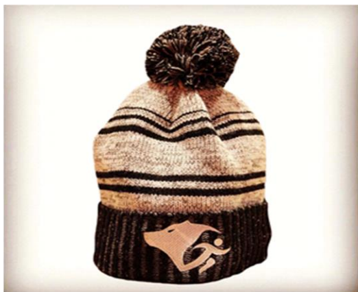
BEAR IN MIND RUNNING TOQUE $35.00