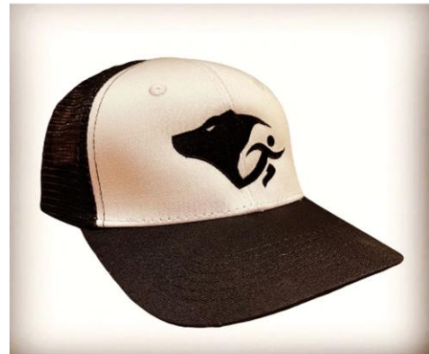
BEAR IN MIND RUNNING TRUCKER CAP $35.00