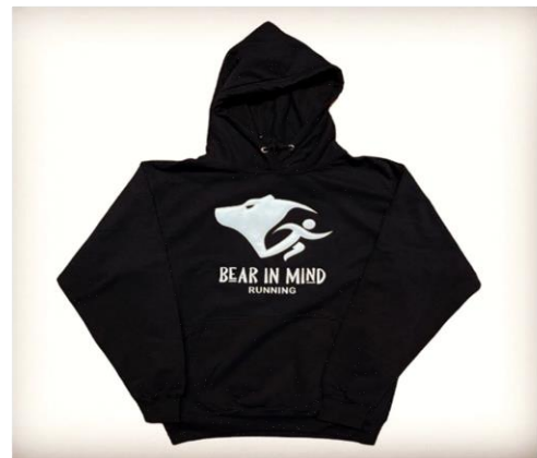
BEAR IN MIND RUNNING HOODIE $100.00