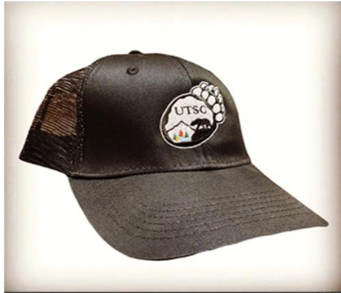
UTSC TRUCKER CAP $35.00