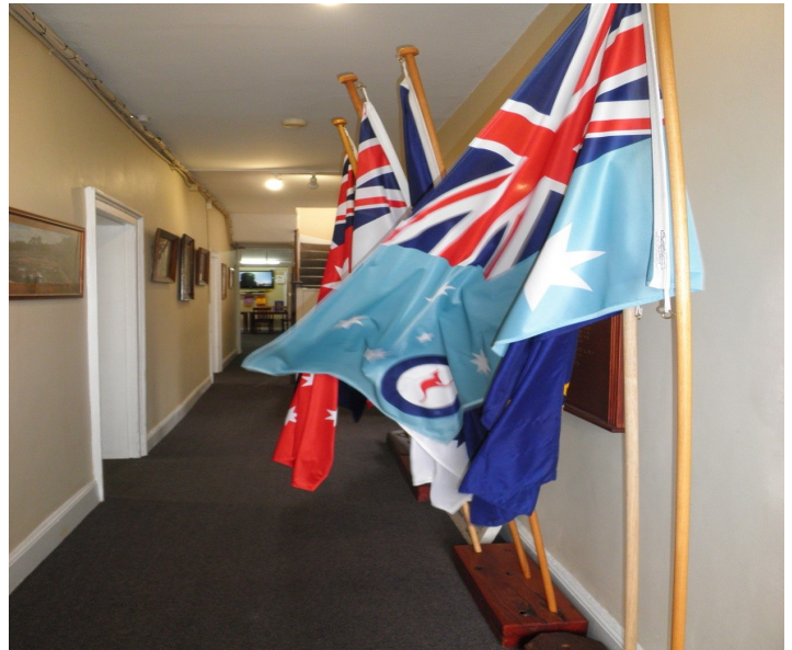
Mt Barker RSL Sub-branch

The Club's opening hours are as follows: