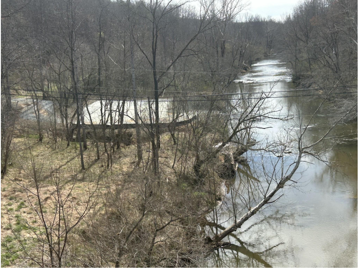
New access road, parking area, and ramp on the Blackwater River in Franklin County. Located at the Rt 122 bridge crossing (Booker T Hiway)