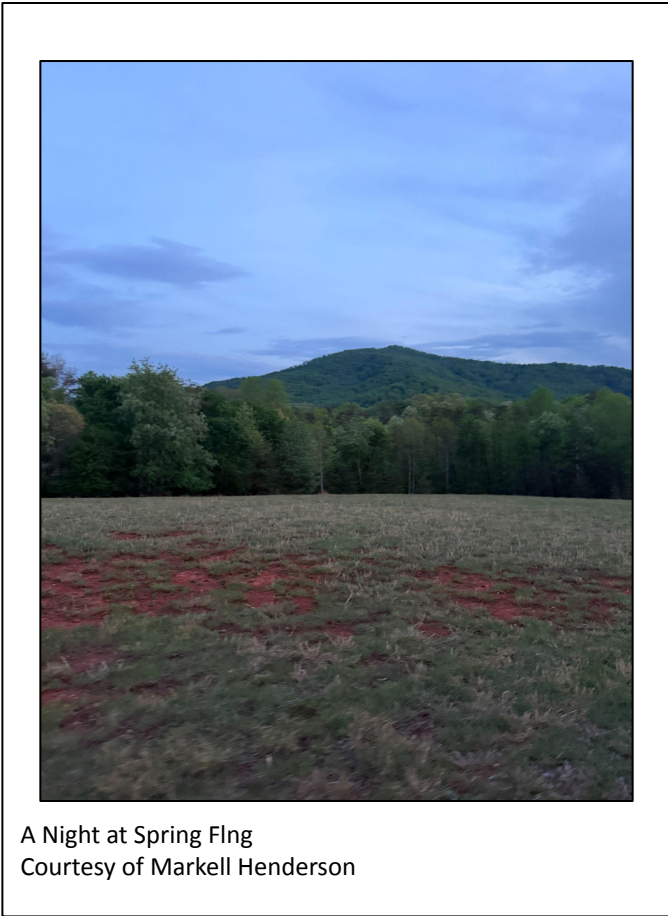
A Night at Spring Fling