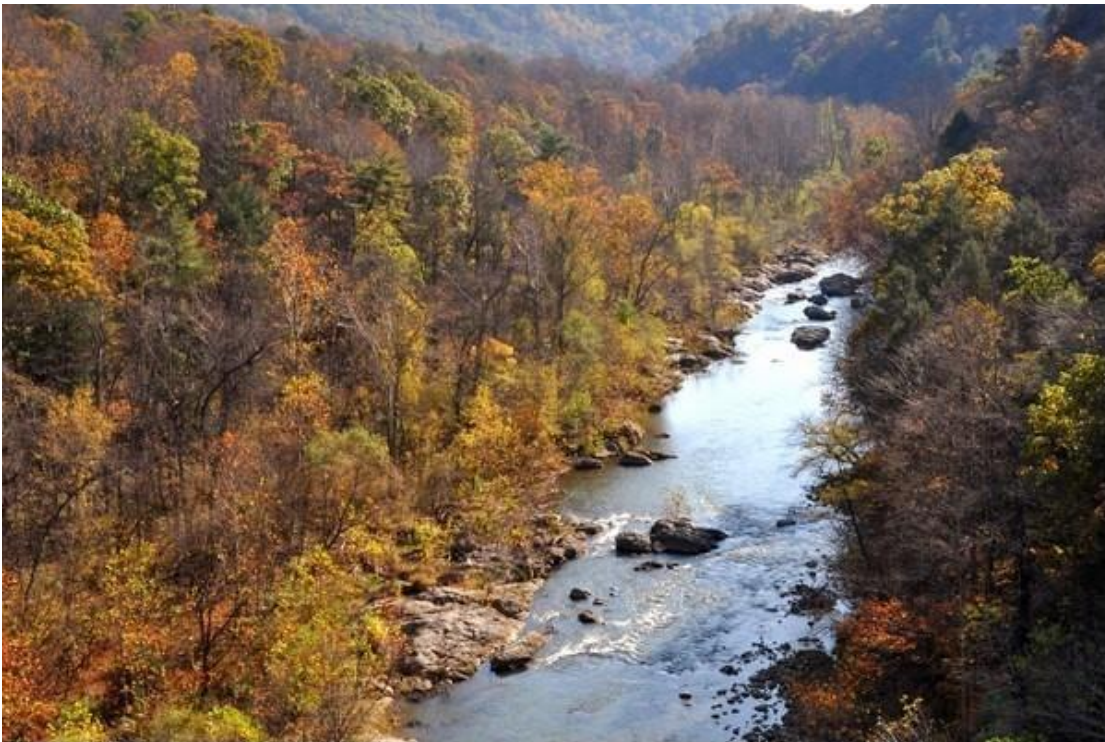
Roanoke River Gorge from the Blue Ridge Parkway

The Roanoke Chapter has lots of experience on this section so check with them on details.