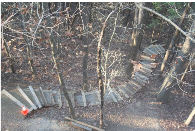
209 Steps to the river... but an easy slide for boats! And parking at the top on the Blue Ridge Parkway.

The steps were built by the Pathfinders (Bill Tanger project manager).