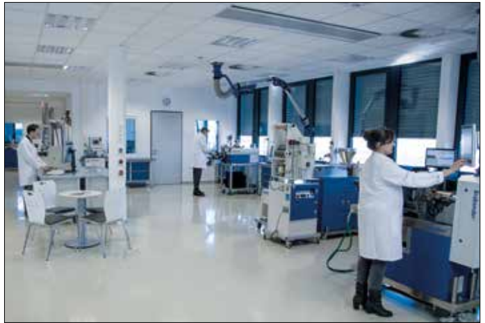
Brabender application laboratory

You can choose to send material to us for testing or schedule a specific Lab Trial with our expert team. In our application laboratory, you will have access to our full product line to help come to a solution for your application.