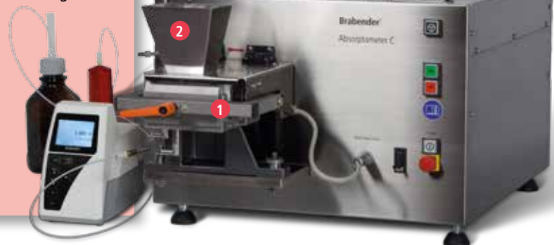
Absorptometer "C" with mixer for testing silica or other free flowing materials

This instrument design is suitable to characterize the structure of other minerals either like limestone, talcum, silicates, aluminum oxides, etc.: a good alternative of the manual oil absorption test in the mining industry and in pigment and additive manufacturing.