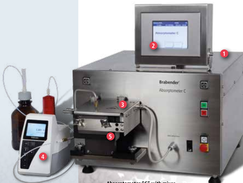
Absorptometer "C" with mixer for testing carbon black