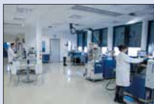
Brabender application laboratory