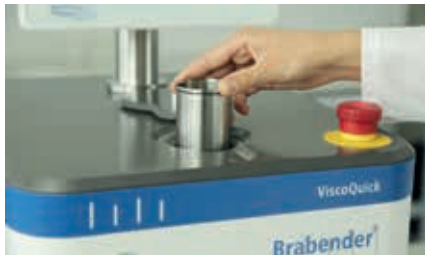
Reusable stainless steel measuring bowl