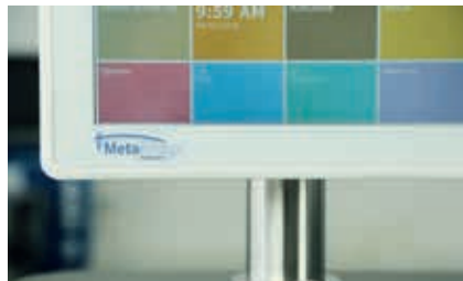
Touchscreen with web-based MetaBridge software