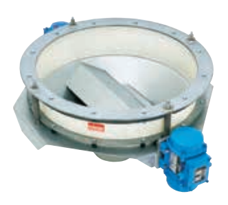
SiloTray: vibratory bin activator for controlled bulk ingredient discharge from silos and bins