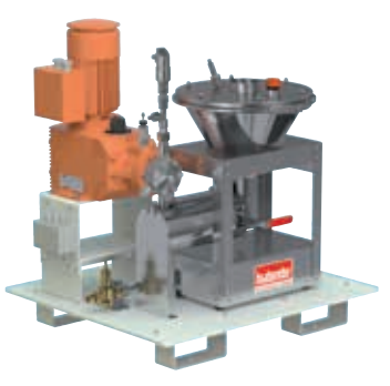
Liquid feeding: loss-in-weight feeder with variable speed metering pump