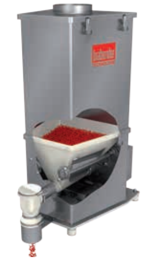
Loss-in-weight batch feeder