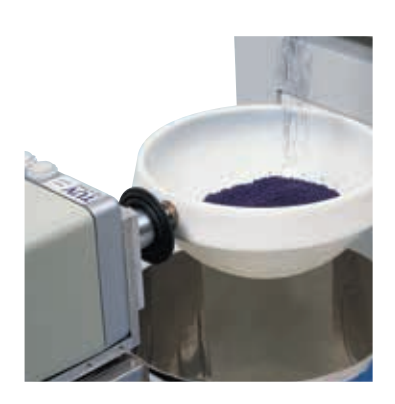
MicroBatch scale: gain-in-weight batching of small ingredient amounts