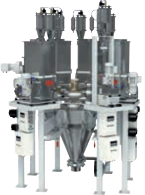
Multiple ingredient gain-in-weight batching system with hopper scale