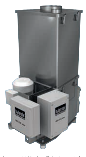
Loss-in-weight feeder with feeder mounted control modules for connection to host/PLC system or Brabender operator interface