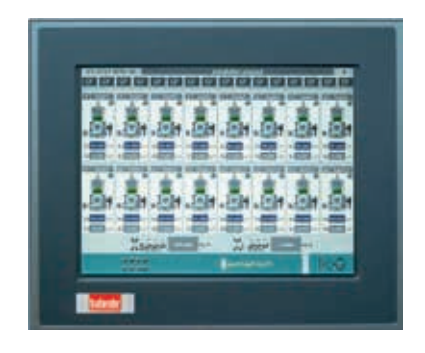
Touch screen operator interface for up to 16 gravimetric feeders