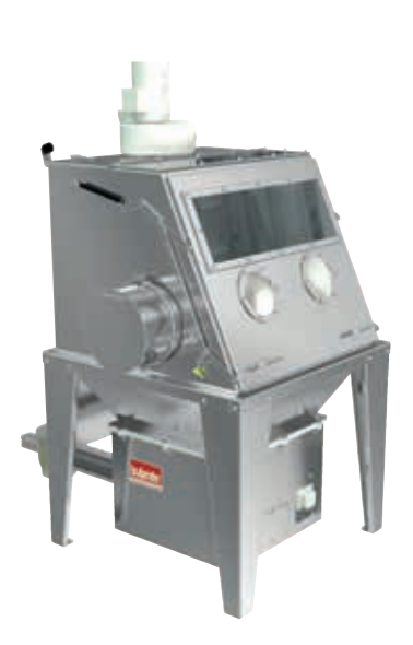
BagDumper: modular bag dump station, available with an optional integrated feeder