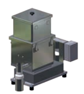
Paddle-massaged PUR hopper: loss-in-weight FlexWall®Classic feeder