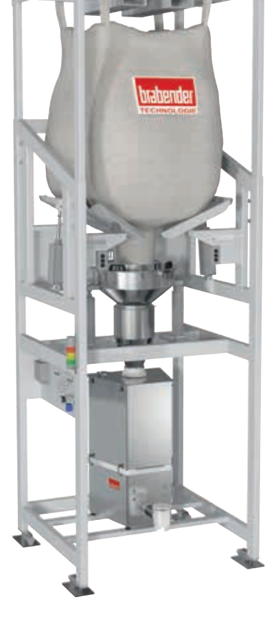
BagMaster: bulk bag unloader for lined or unlined bulk bags, available with an optional integrated feeder