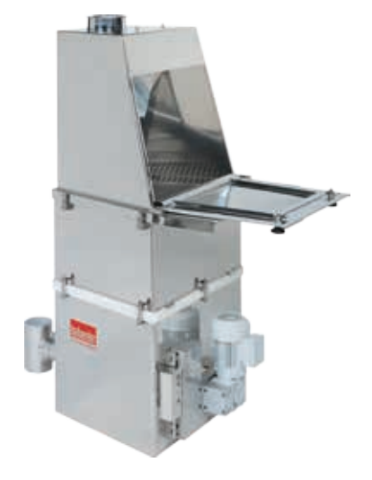
Bag dump hopper: extension hopper for volumetric FlexWall® feeders allowing to fill bagged ingredients directly into the feeder