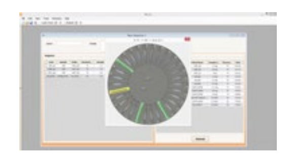
Example of Sequence development screen for Solid Sample Autosampler

User, sample, method, calibration, task, sequence and report definitions are entered through user friendly software screens.