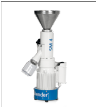
Break Mill SM 4