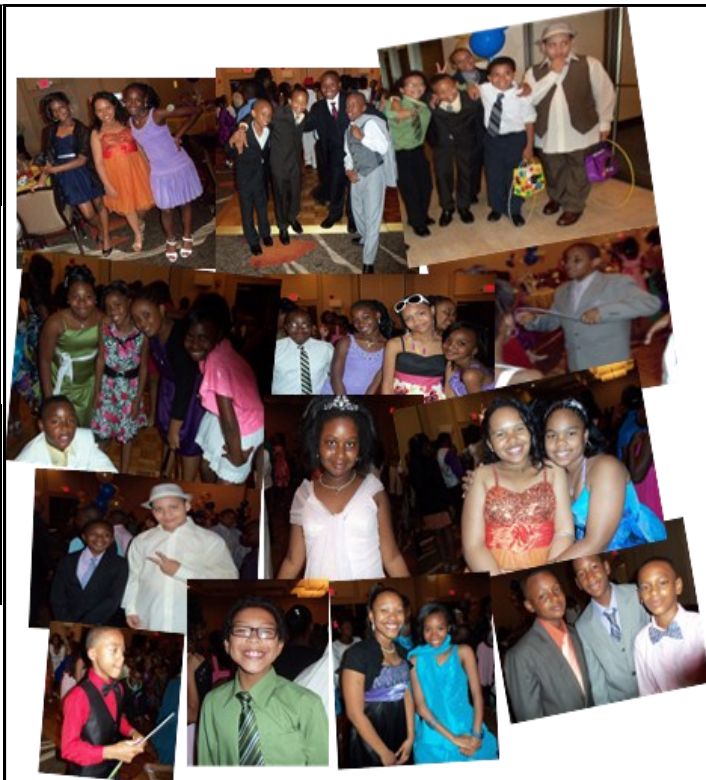
To the right above Afterschool Seniors celebrate their success at their social on Friday, June 22, 2012.